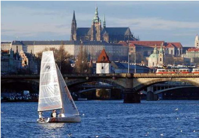
Fulcrum sailing team / Prague owner CZE005&006